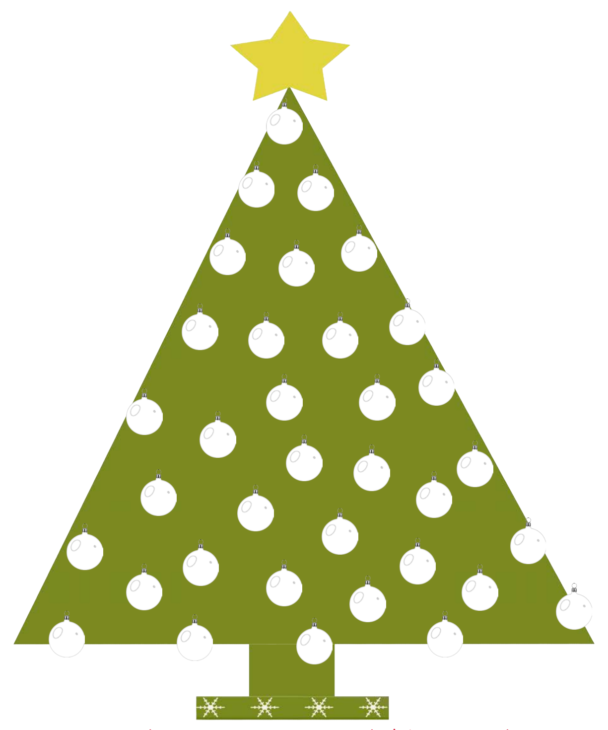
Each day enjoy this special time with your preschooler! After completing the day's activity, encourage your preschooler to color one of the ornaments on the Christmas tree.